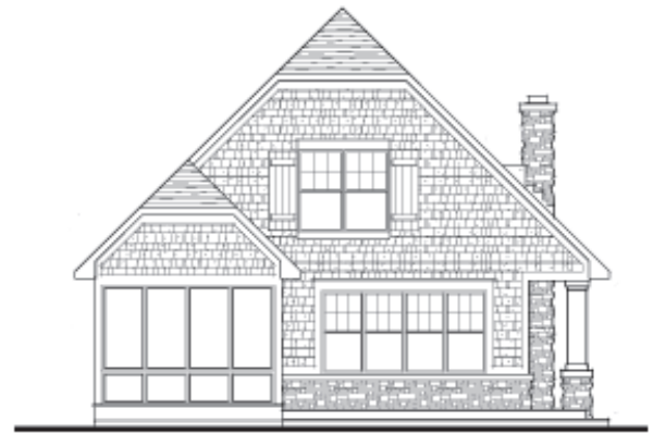
SOUTH ELEVATION (LAKE SIDE ELEVATION)